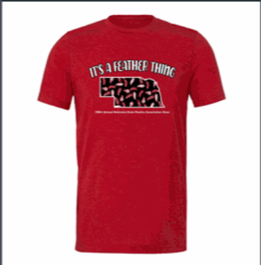
Bella+Canvas - Jersey Short Sleeve (ADULT)