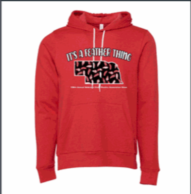
Bella+Canvas - Sponge Fleece Hoodie (ADULT)