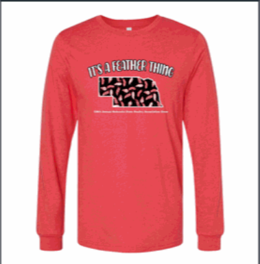
Bella+Canvas - Jersey Long Sleeve (ADULT)