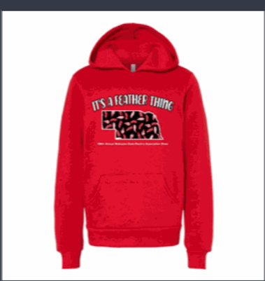
Bella+Canvas - Sponge Fleece Hoodie (YOUTH)