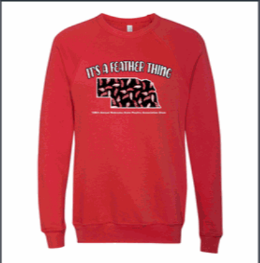
Bella+Canvas - Sponge Fleece Sweatshirt (ADULT)