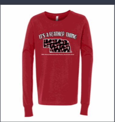
Bella+Canvas - Jersey Long Sleeve (YOUTH)