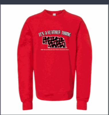
Bella+Canvas - Sponge Fleece Sweatshirt (YOUTH)