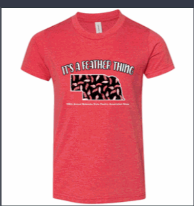
Bella+Canvas - Jersey Short Sleeve (YOUTH)