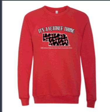
Bella+Canvas - Sponge Fleece Sweatshirt (ADULT)