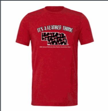
Bella+Canvas - Jersey Short Sleeve (ADULT)