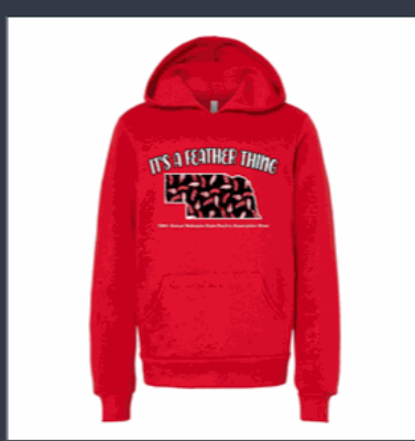
Bella+Canvas - Sponge Fleece Hoodie (YOUTH)