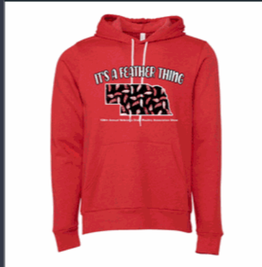
Bella+Canvas - Sponge Fleece Hoodie (ADULT)