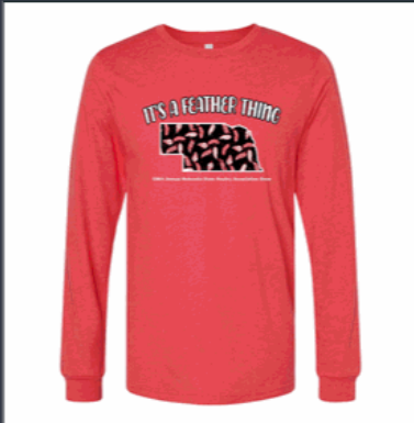
Bella+Canvas - Jersey Long Sleeve (ADULT)