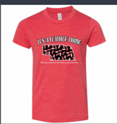
Bella+Canvas - Jersey Short Sleeve (YOUTH)