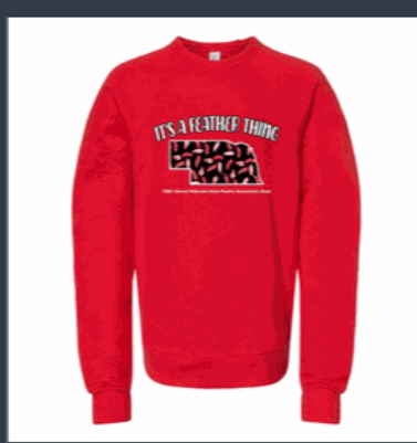
Bella+Canvas - Sponge Fleece Sweatshirt (YOUTH)