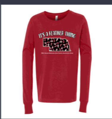
Bella+Canvas - Jersey Long Sleeve (YOUTH)